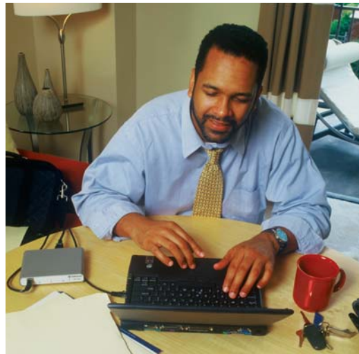
Telkonet's iBridge plug-and-play concept makes it easy to use, while delivering reliable and consistent performance.

Users will find the Telkonet iBridge easy to use. There are no drivers or additional software to install, and typically, computer laptop settings do not need to be changed.